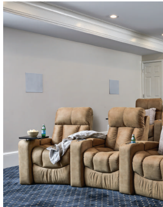
One of two movie theaters features a Stanton carpet from the Carpet Palace. The walls are painted in Edgecomb Gray by Benjamin Moore.