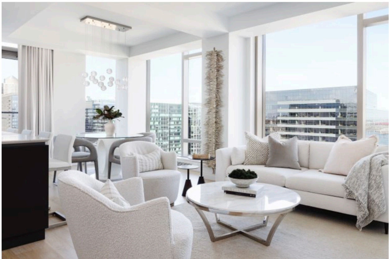
📷 Design by Gina Baran

Below, you'll find eight useful guidelines to keep in mind if you choose to go the monochromatic route in your own home.