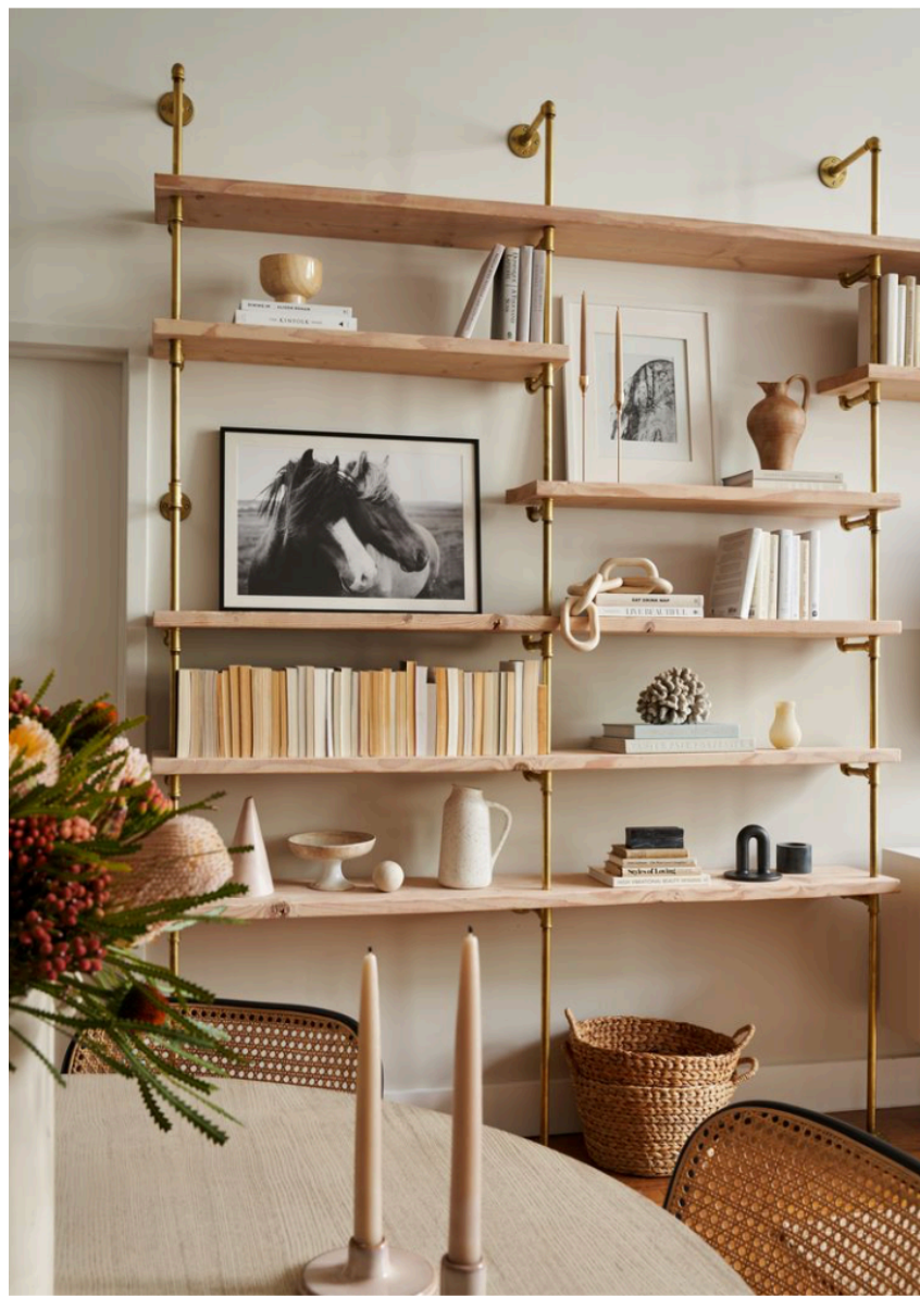
📷 Design by DATE Interiors

Weaving in natural elements is also a smart approach, Boutlier explains. Why not shop your backyard to get started? He often draws upon woods, branches, flowers, natural stone, and earthenware pottery in his own monochromatic projects.