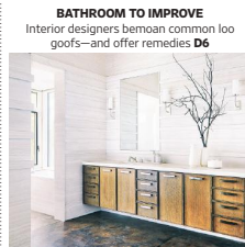
BATHROOM TO IMPROVE Interior designers bemoan common loo goofs—and offer remedies D6