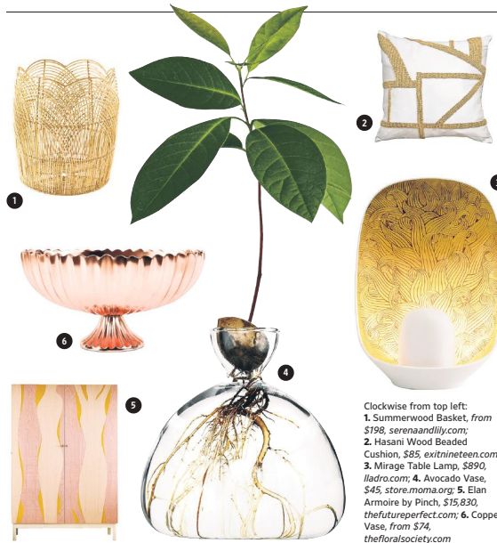
Clockwise from top left: 1. Summerwood Basket, from $198, serenaandlily.com; 2. Hasani Wood Beaded Cushion, $85, avtrineten.com; 3. Mirage Table Lamp, $890, lladro.com; 4. Avocado Vase, $45, store.moma.org; 5. Elan Armoire by Pinch, $15,830, thefutureperfect.com; 6. Copper Vase, from $74, thefloralsociety.com

A large tiled step that made the toilet sit higher than everything else in the bathroom. It was like you had to climb to get up there. —Melissa Warner Rothblum, designer, Los Angeles