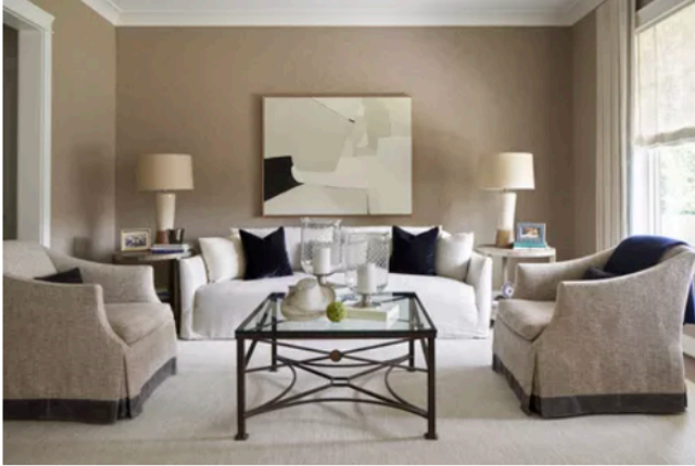
Greg Powers for Tracy Morris

Given that furniture can be quite pricey, you may wish to spread out your purchases over time. If you're not sure what to buy first, think big—literally. "Start with the larger pieces to ground the room, like the sofa or the area rug, and build from there," Arditì says.