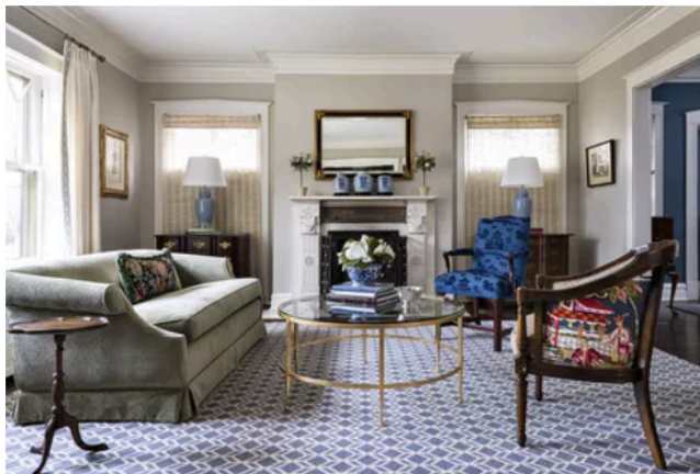
Chris Bradley for M. Lavender Interiors

Before grabbing your wallet, you'll want to consider how your ideal furniture pieces will function in a space. "Gather images of the pieces you intend to use and make a small 'room board,'" Lester suggests. "See how all of the pieces interact with each other and play off of one another before you get them home." You may find