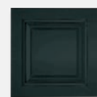
Salamander Benjamin Moore