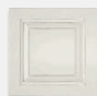
White Dove Benjamin Moore