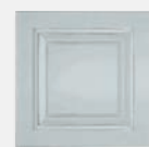
Blue Lace Benjamin Moore