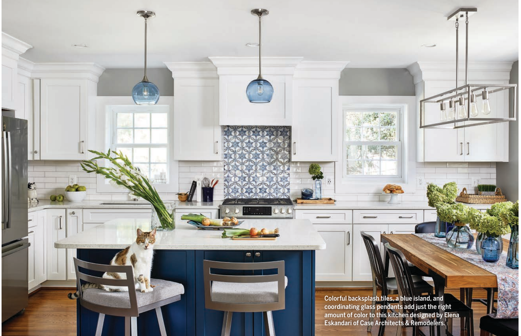
Colorful backsplash tiles, a blue island, and coordinating glass pendants add just the right amount of color to this kitchen designed by Elena Eskandari of Case Architects & Remodelers.