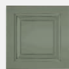
Card Room Green Farrow & Ball