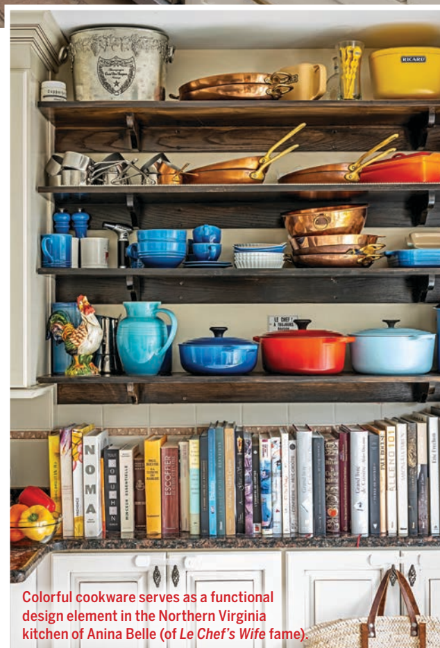
Colorful cookware serves as a functional design element in the Northern Virginia kitchen of Anina Belle (of Le Chef's Wife fame).

Open shelving stocked with colorful Le Creuset or Staub Dutch ovens and braisers elevates pot storage to an art form.