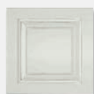
Winter White Benjamin Moore