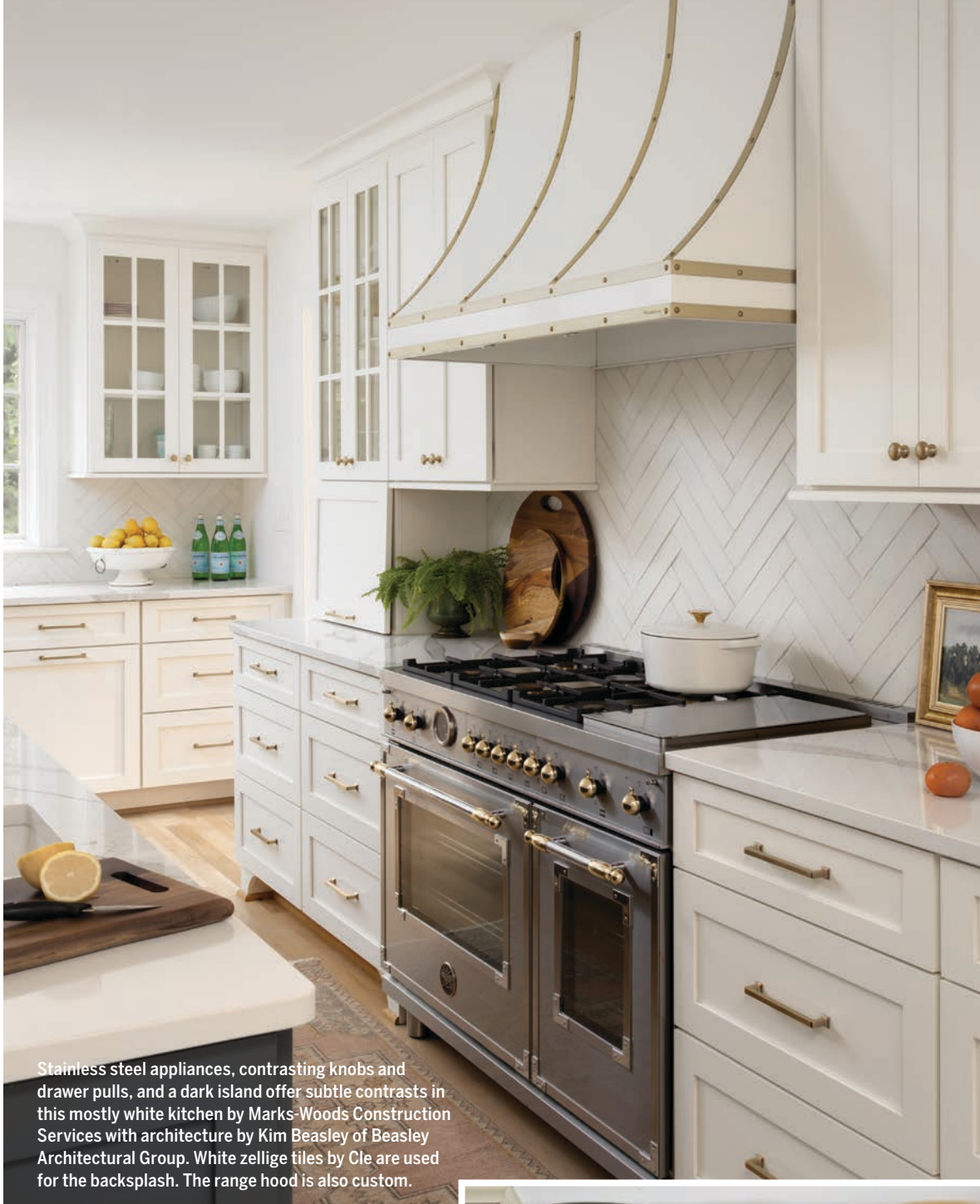
Stainless steel appliances, contrasting knobs and drawer pulls, and a dark island offer subtle contrasts in this mostly white kitchen by Marks-Woods Construction Services with architecture by Kim Beasley of Beasley Architectural Group. White zellige tiles by Cle are used for the backsplash. The range hood is also custom.

When selecting the cabinet colors, Wall keys in on what a client responds to. “A lot of it depends on the direction the kitchen is going in,” adds Steele, who makes sure the tones of the cabinets, counters, and backsplashes are unified. Wall and Steele often collaborate and are currently working on a kitchen with white upper cabinets and Benjamin Moore Dollar Bill Green base cabinets with a pantry painted in Benjamin Moore Baked Terra Cotta. “We often color block kitchens to denote