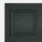
Studio Green Farrow & Ball