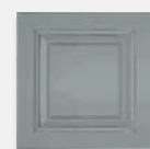
Cobblestone Path Benjamin Moore