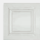
Decorator's White Benjamin Moore