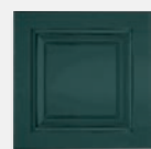
Dollar Bill Green Benjamin Moore