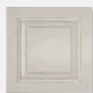
Ammonite Farrow & Ball