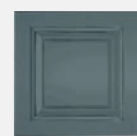
De Nimes Farrow & Ball