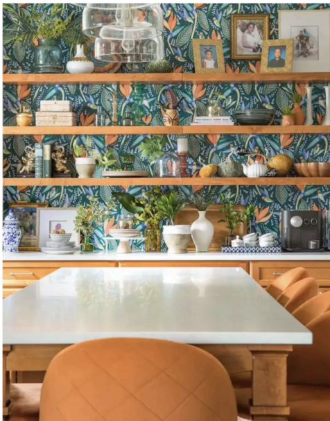
CASA WATKINS LIVING

Because teal is opposite to orange on the color wheel, they play so nicely together. Pick darker teal shades to help ground the bright orange colors for a punchy, bold look that is great in kitchens, bathrooms or dens.