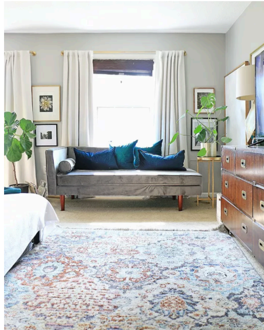
URSULA CARMONA OF HOME MADE BY CARMONA

Whether decorating a simple, Scandi-inspired bedroom or renovating a more modern living room, greige is a great all-purpose color. To avoid a bland greige room, though, add a few pops of teal via throws or pillows to brighten up the space.