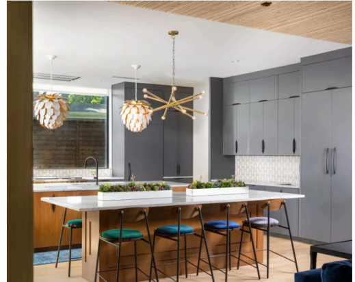
DESIGN: MAESTRI STUDIO

Though teal may not be the first color you gravitate to when decorating with a medium gray, it's perfect for bringing out the cool tones and ensuring the gray doesn't lack personality or liveliness.