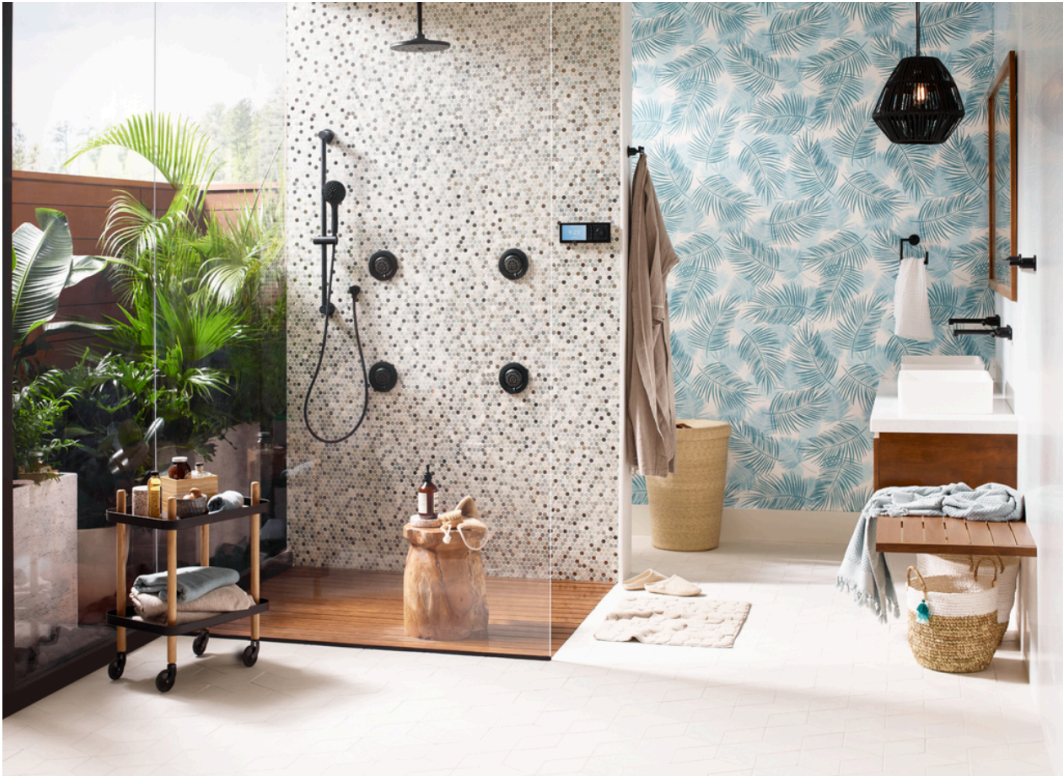
The U by Moen Shower 2-Outlet Digital Shower Controller allows shower control from voice, phone or controller.

“Alexa, turn on the shower” is a command made possible by the U by Moen Shower 2-Outlet Digital Shower Controller in beige or black (starting at $664 with required thermostatic digital shower valve at amazon.com ). Recommended by designer Steve Kadlec, founder and principal of Kadlec Architecture and Design in Chicago, the tool allows shower control from voice, phone or controller. Set a time for your shower, start and pause to control water use, and control the temperature. It’s also available with four outlets.