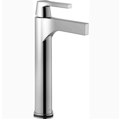
Delta's Zura Single Handle Touch2O Vessel Bathroom Faucet is hands-free and, thus, germ-free.

Simplehuman's Sensor Mirror Hi-Fi Makeup Mirror ($300 at nordstrom.com) has five-times magnification for makeup application or shaving. "I just love that it turns on upon approach and simulates natural sunlight," says Tracy Morris, an interior designer in McLean, Virginia. "In this latest version, you can apply your makeup and complete other tasks in the room with Alexa."