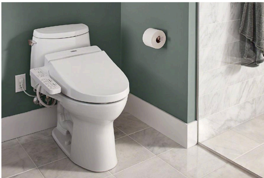
Toto's Washlet C100 Electric Bidet Seat has a wireless remote that adjusts water pressure, temperature and position.

Casey Hardin, a North Carolina-based designer for Decorist, recommends hands-free (and thus, germ-free) faucets, such as Delta's Zura Single Handle Touch2O Vessel Bathroom Faucet (starting at $38 at homedepot.com). Once only for commercial bathrooms, these faucets are making their way into homes. Turn water on and off manually with a light touch to the spout or handle or by placing hands near the faucet. It uses 20% less water than industry-standard faucets.