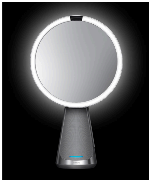
Simplehuman's Sensor Mirror Hi-Fi Makeup Mirror has five-times magnification and is Alexa-enabled.

“Alexa, turn on the shower” is a command made possible by the U by Moen Shower 2-Outlet Digital Shower Controller in beige or black (starting at $664 with required thermostatic digital shower valve at amazon.com ). Recommended by designer Steve Kadlec, founder and principal of Kadlec Architecture and Design in Chicago, the tool allows shower control from voice, phone or controller. Set a time for your shower, start and pause to control water use, and control the temperature. It’s also available with four outlets.