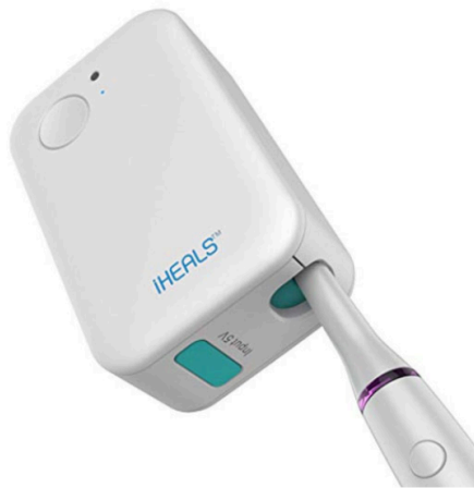
The MAXOAK UV Toothbrush Sanitizer Case is a portable toothbrush sanitizer.

However, “Toto offers simpler models for less,” she says, including the Washlet C100 Electric Bidet Seat (starting at $366 at homedepot.com ). A wireless remote adjusts water pressure, temperature and position. The seat is heated, and the lid closes softly. The seat also includes a warm air dryer and air deodorizer.