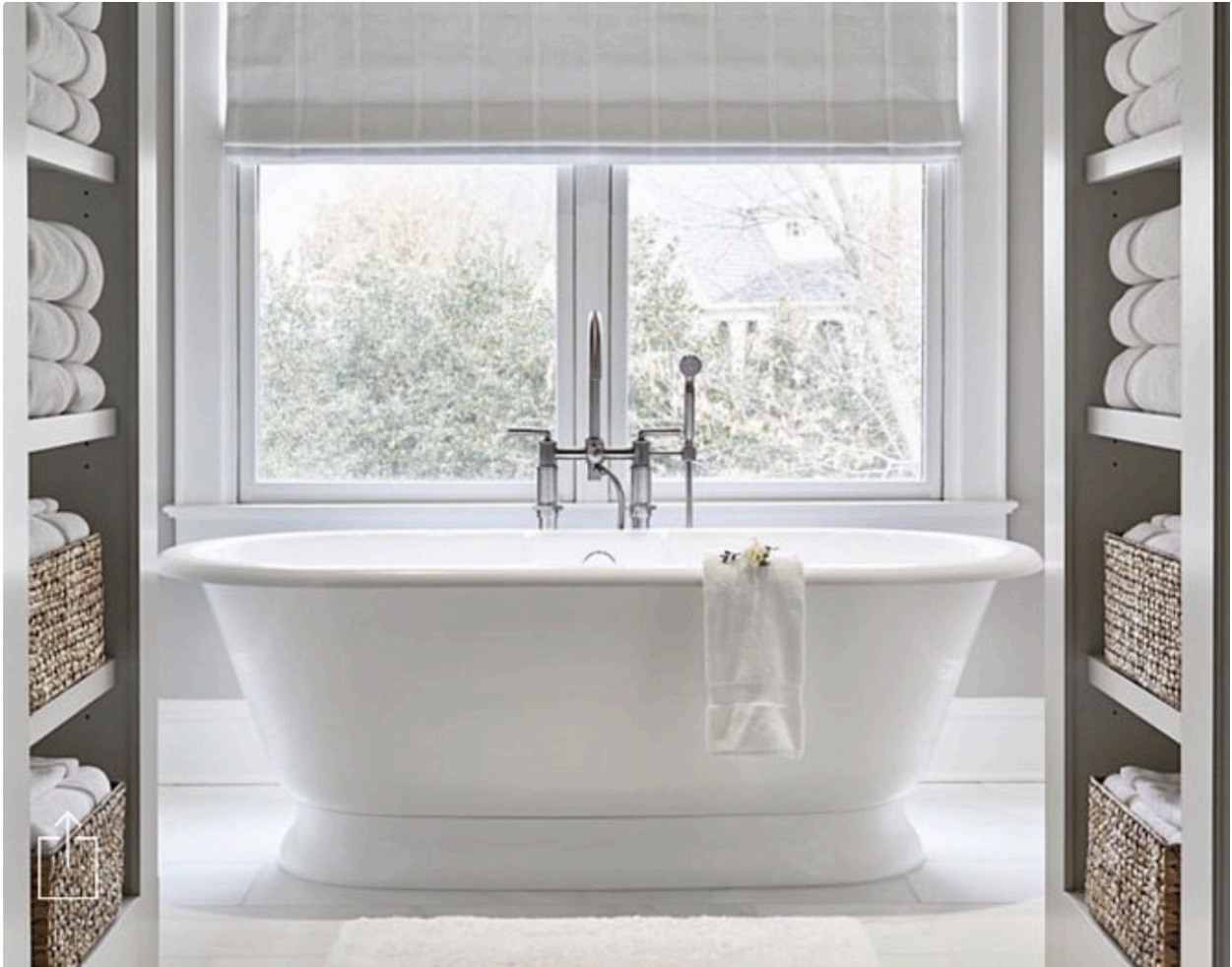
A free-standing tub was part of a McLean home remodel by interior designer Tracy Morris.

Sunny, free-flowing home created by removing walls and adding windows.